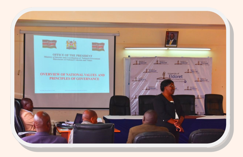
National cohesion and Nation value committee carrying out the UoE staff sensitization.