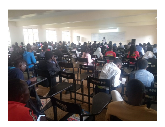
It was a great day for students living with disabilities and also all members who attended.

PWD awareness day was an inclusive event as defined by the theme of that day "inclusivity". The event was attended by PWD members, most class reps, leaders of different associations and students who are not PWD summing up to 150 participants. Most of the students were eager to know more about PWD of which at the end of the event they were able to understand more about persons living with disabilities. The session was interactive and free for everybody. Most of the people asked questions and they were able to get clarification.