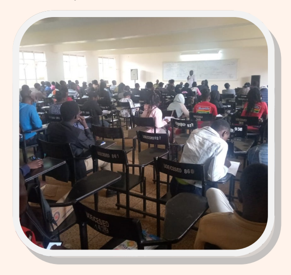
PWD awareness day at NS building.

UoE Students doing Clean up exercise at Kabarnet Municipality.